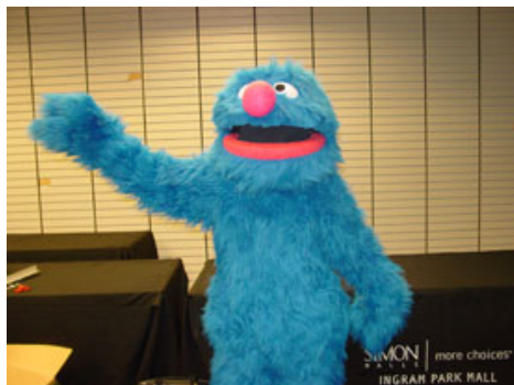
Walkaround Grover prepared young kids for school this July through an event put on by Early ON, a school readiness project.